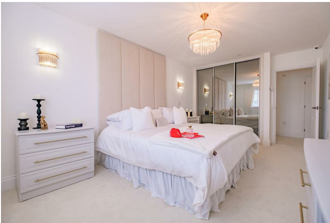
Master Bedroom 10'5" x 18'5"* (3.19m x 5.62m*)