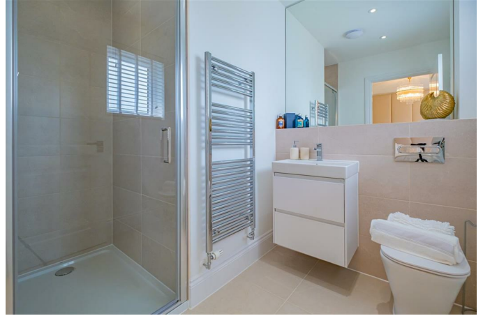
En-Suite 8'8" x 6'4"* (2.66m x 1.94m*)