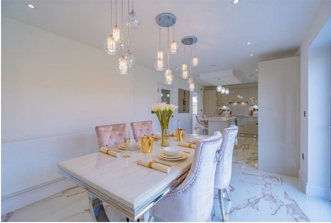
Dining 13'9" x 10'4"* (4.20m x 3.15m*)