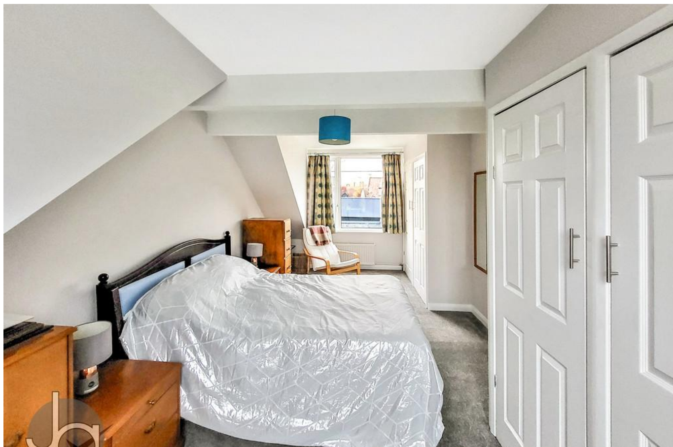
Beckingham Street, Tolleshunt Major CM9 8LL