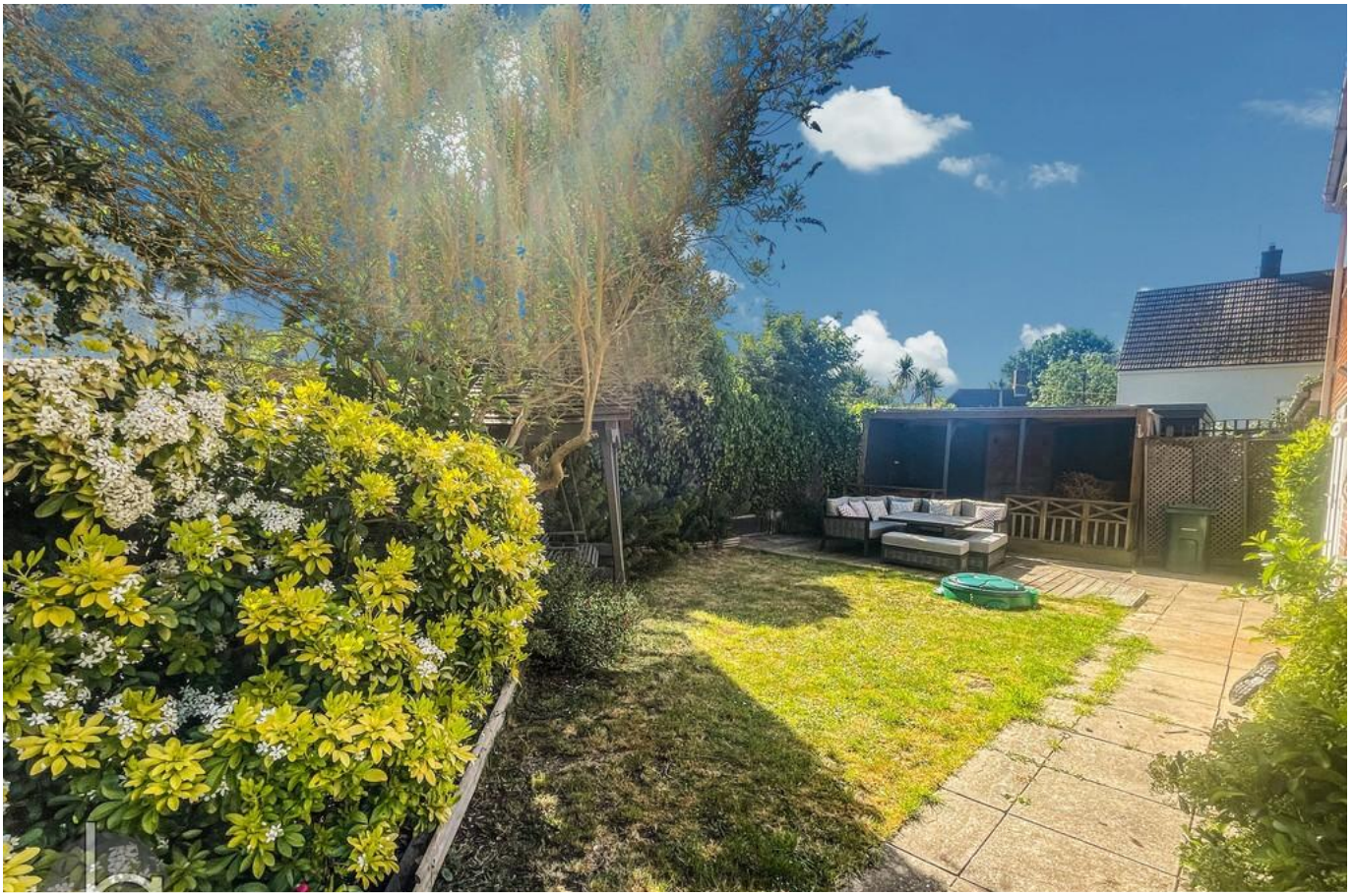
Field View Drive, Little Totham CM9 8ND