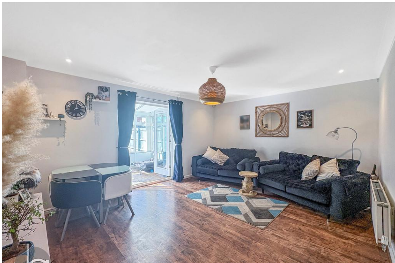
Hutchinson Close, Tiptree CO5 0HE