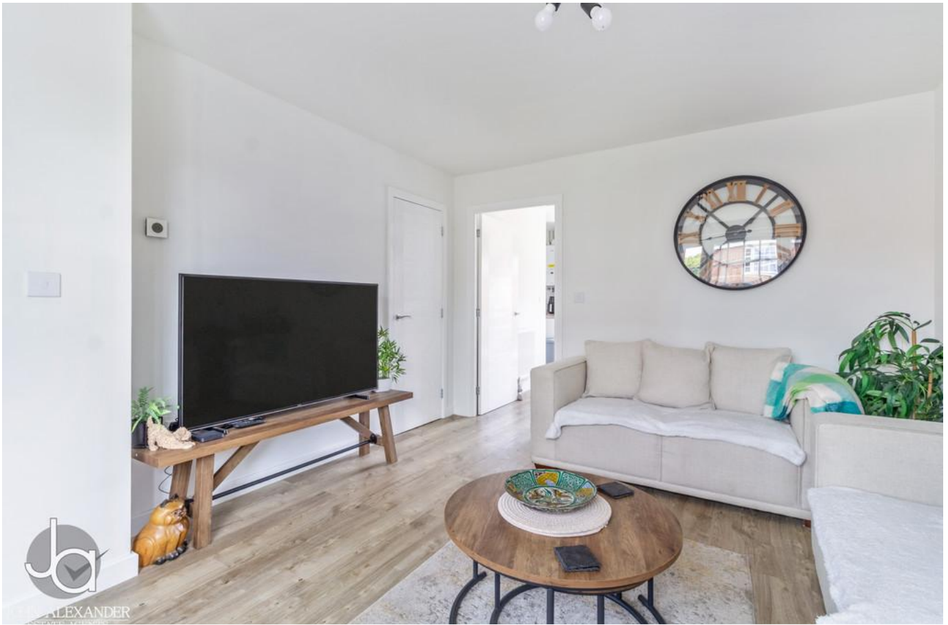
Ager Avenue, Tiptree CO5 0GL