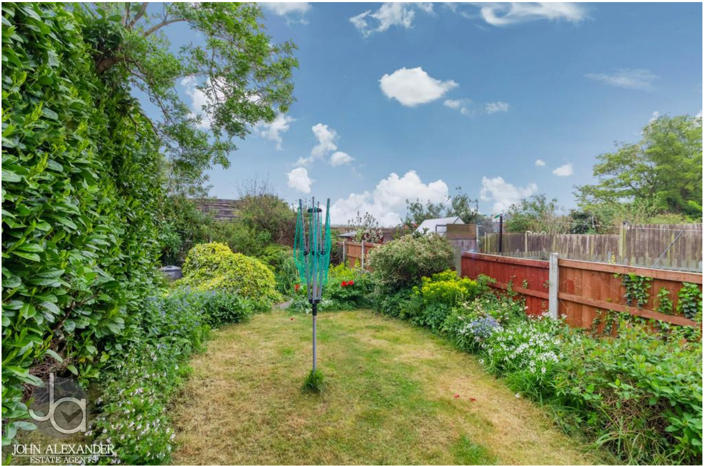
Abraham Drive, Silver End, CM8 3SP