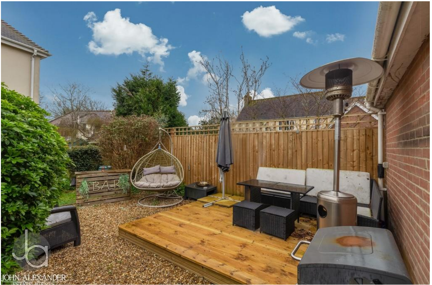
Mill Close, Tiptree CO5 0LE