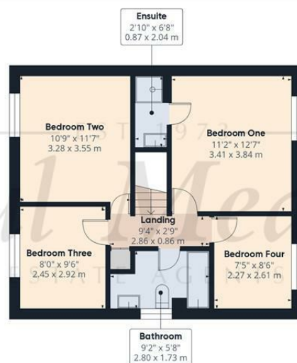
First Floor Building 1

Approximate total area 1265.53 ft 2 117.57 m 2