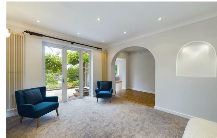
Entrance Hall 10'10 x 5'6 (3.30m x 1.68m)