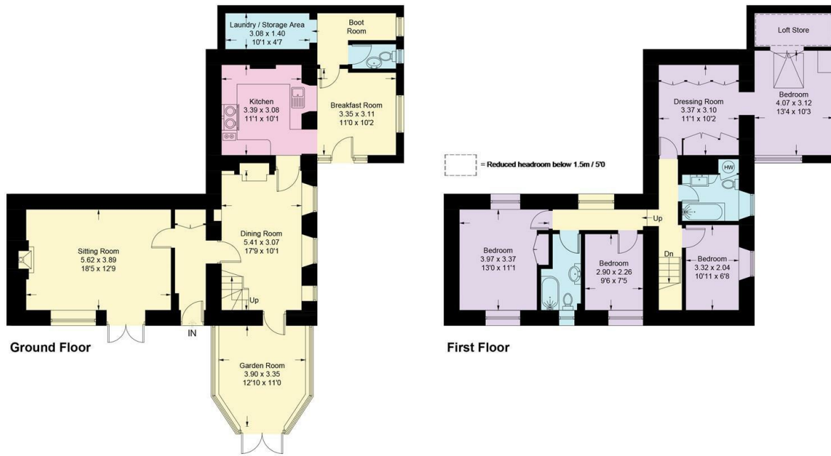
Illustration for identification purposes only, measurements are approximate, not to scale. Fourlabs.co © (ID1231114)

Approximate Gross Internal Area = 178.8 sq m / 1925 sq ft