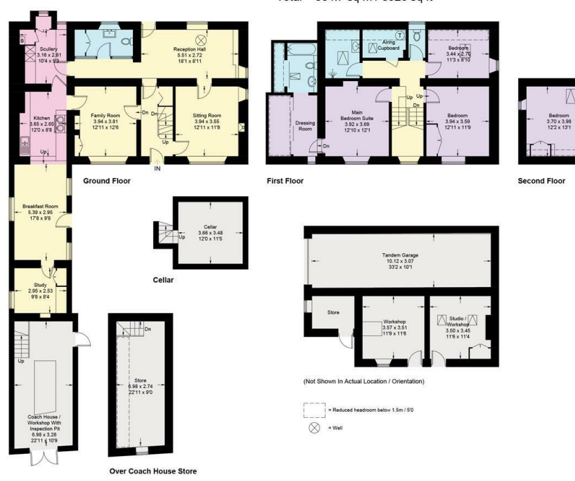
Illustration for identification purposes only, measurements are approximate, not to scale. (ID1018524)

Approximate Gross Internal Area = 240.4 sq m / 2588 sq ft Cellar = 14 sq m / 151 sq ft Outbuildings = 110.3 sq m / 1187 sq ft Total = 364.7 sq m / 3926 sq ft