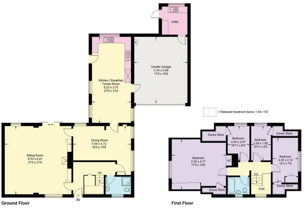
Illustration for identification purposes only, measurements are approximate, not to scale. floorplansUsketch.com @ (ID1111323)

Approximate Gross Internal Area = 215.7 sq m / 2322 sq ft (Including Double Garage / Utility / Excluding Eaves)