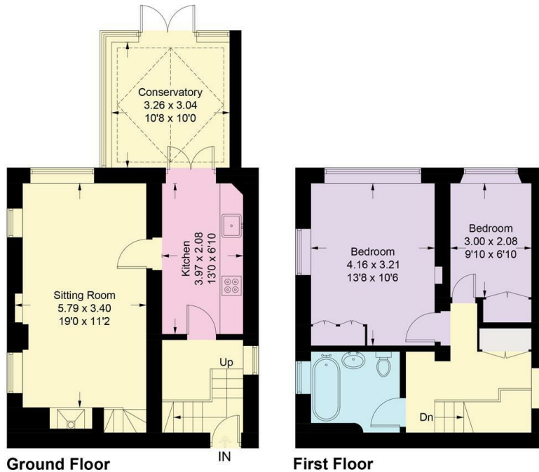
Illustration for identification purposes only, measurements are approximate, not to scale. floorplansUsketch.com © (ID979499)

Approximate Gross Internal Area = 85.0 sq m / 915 sq ft