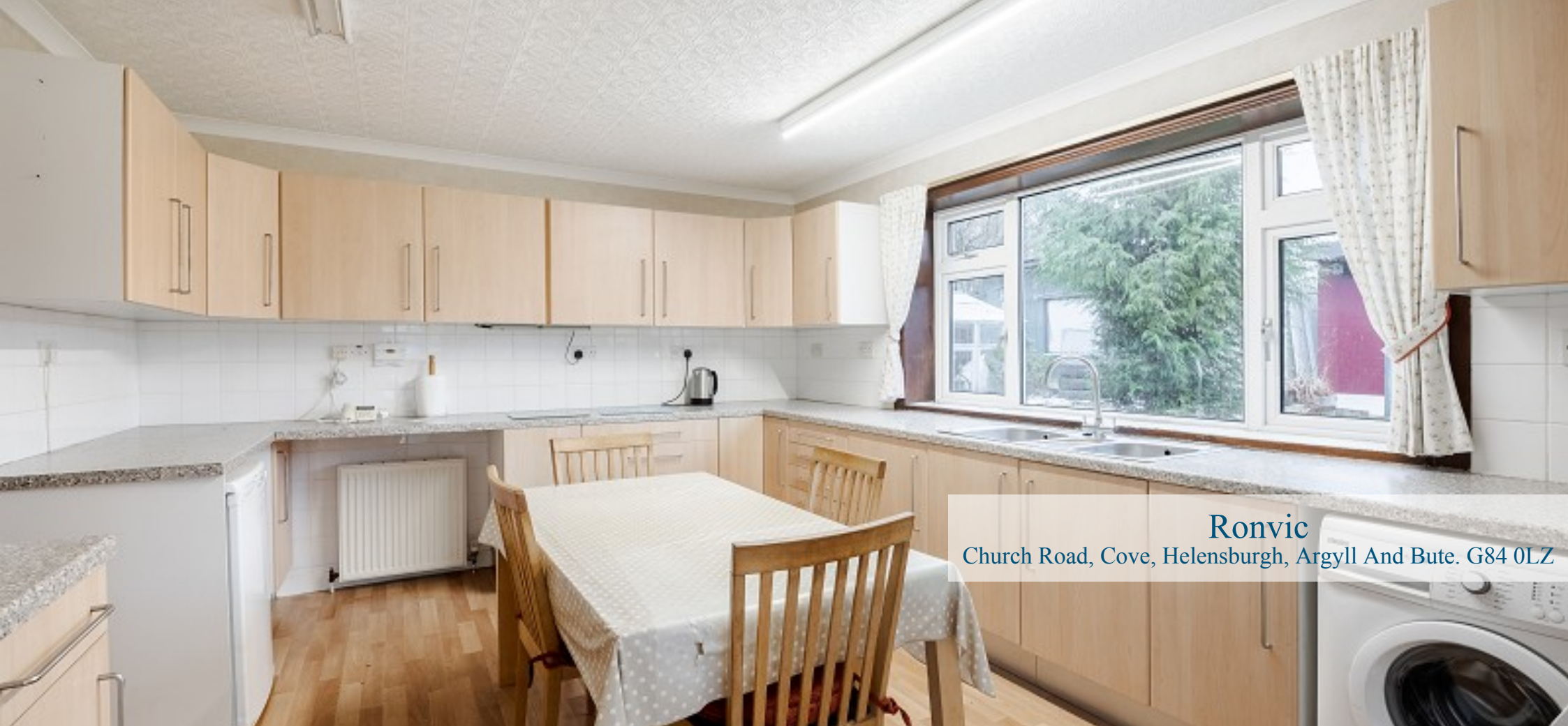
Ronvic Church Road, Cove, Helensburgh, Argyll And Bute. G84 0LZ