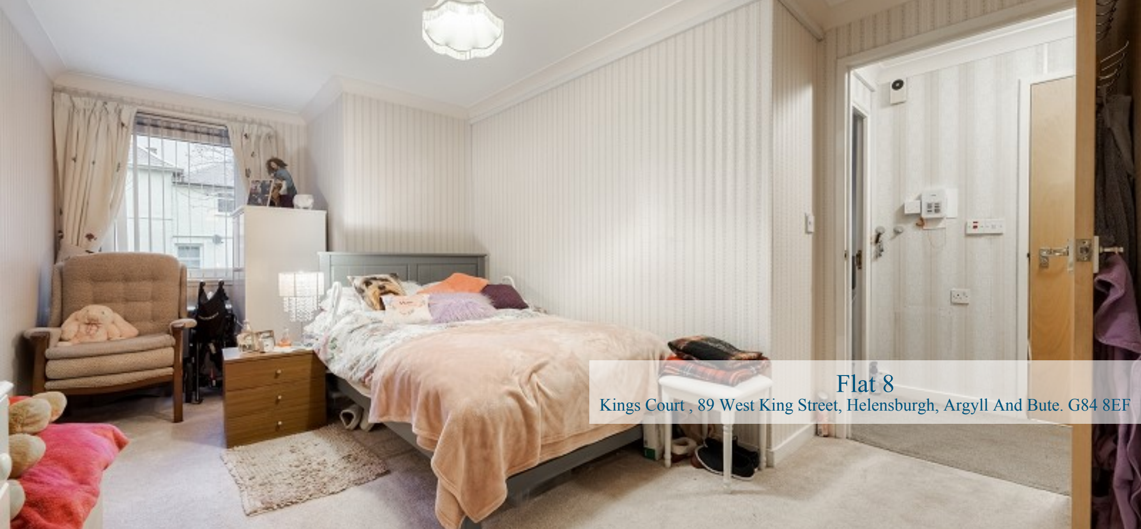
Flat 8 Kings Court , 89 West King Street, Helensburgh, Argyll And Bute. G84 8EF