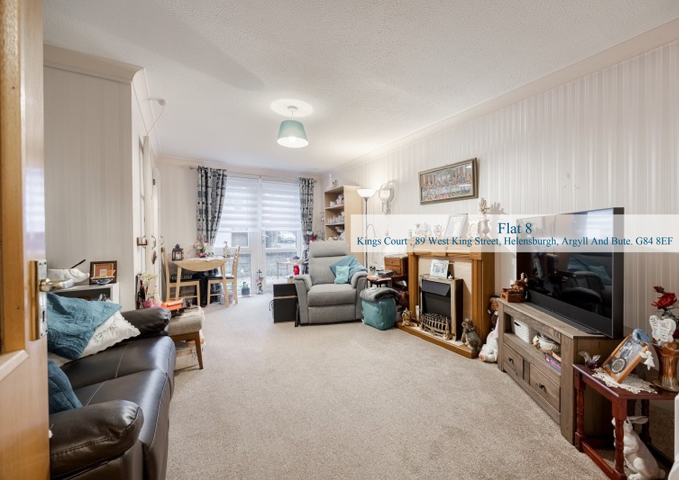
Flat 8 Kings Court , 89 West King Street, Helensburgh, Argyll And Bute. G84 8EF