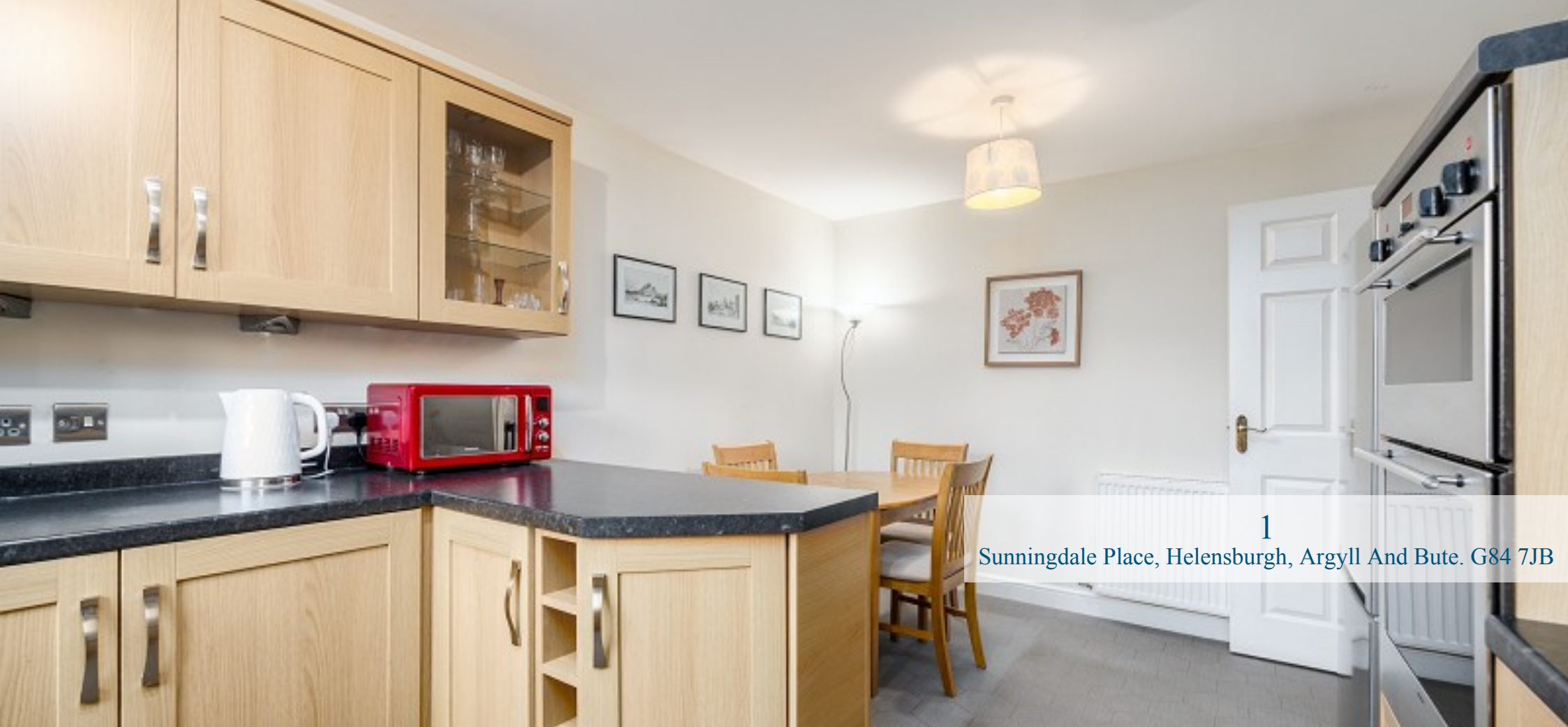
1 Sunningdale Place, Helensburgh, Argyll And Bute. G84 7JB