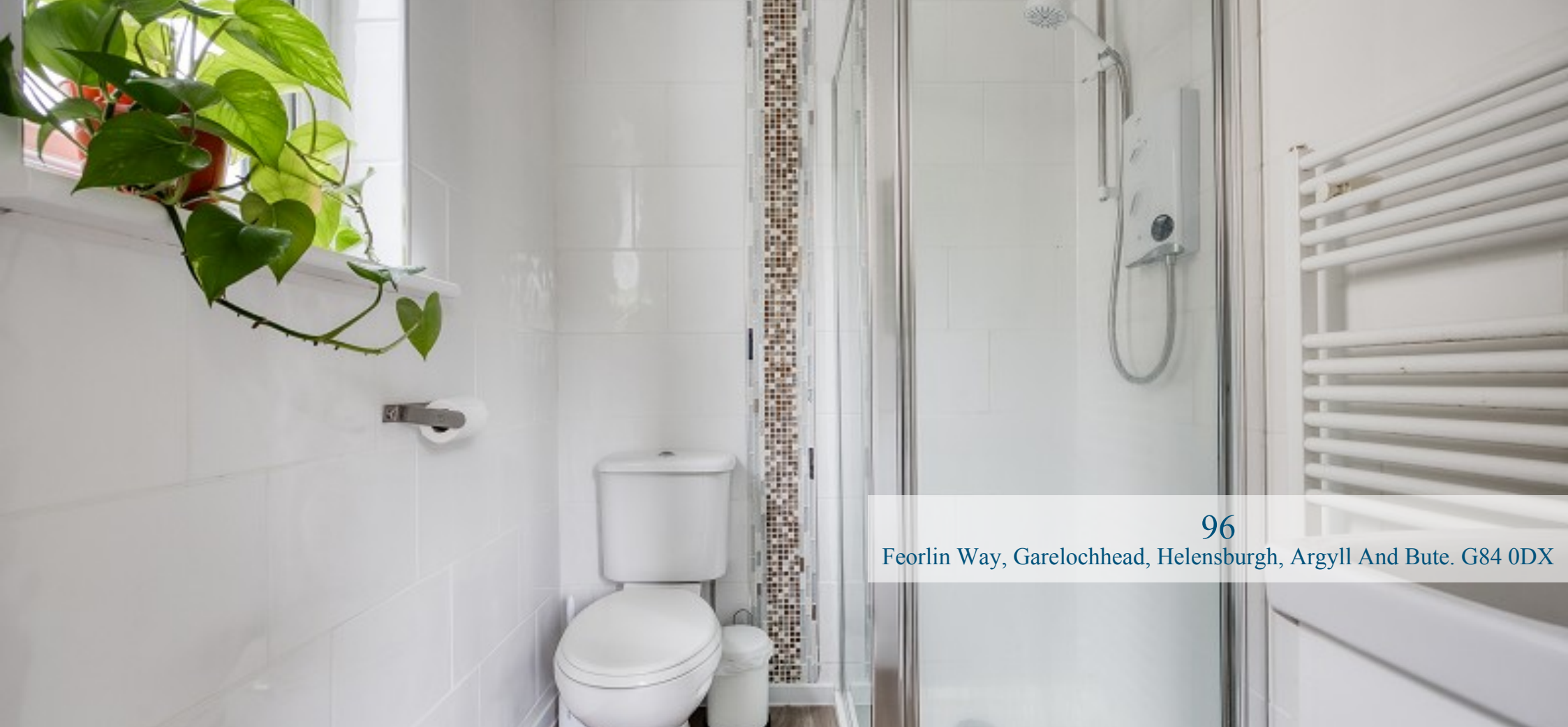
96 Feorlin Way, Garelochhead, Helensburgh, Argyll And Bute. G84 0DX