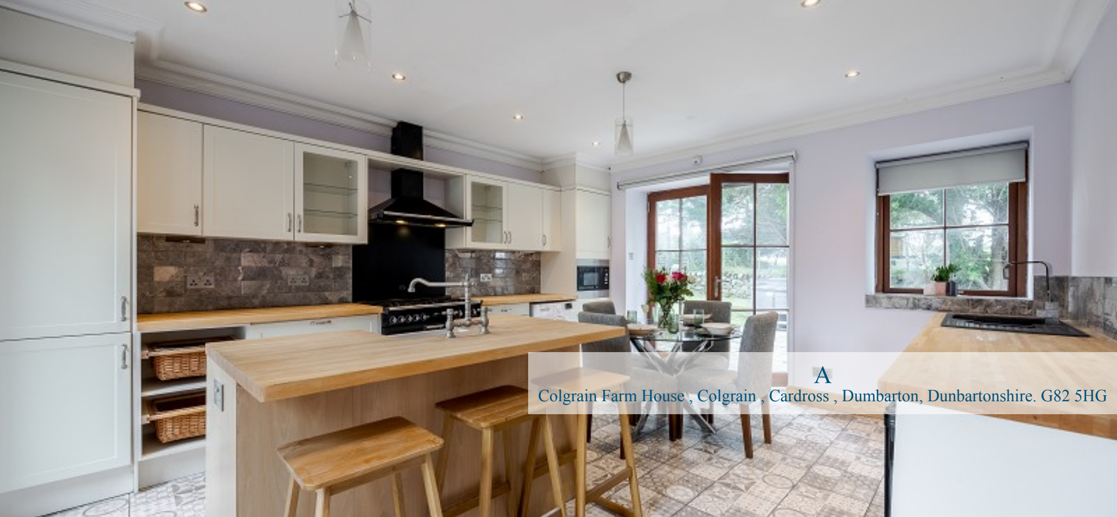
A Colgrain Farm House , Colgrain , Cardross , Dumbarton, Dunbartonshire. G82 5HG