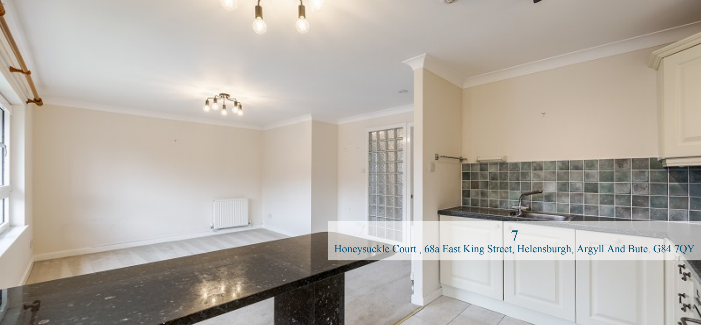
7 Honeysuckle Court , 68a East King Street, Helensburgh, Argyll And Bute. G84 7QY