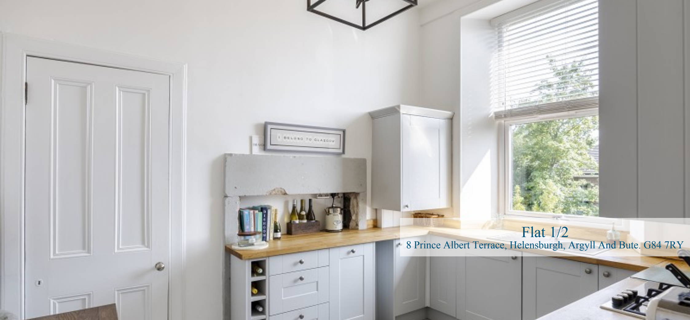
Flat 1/2 8 Prince Albert Terrace, Helensburgh, Argyll And Bute. G84 7RY