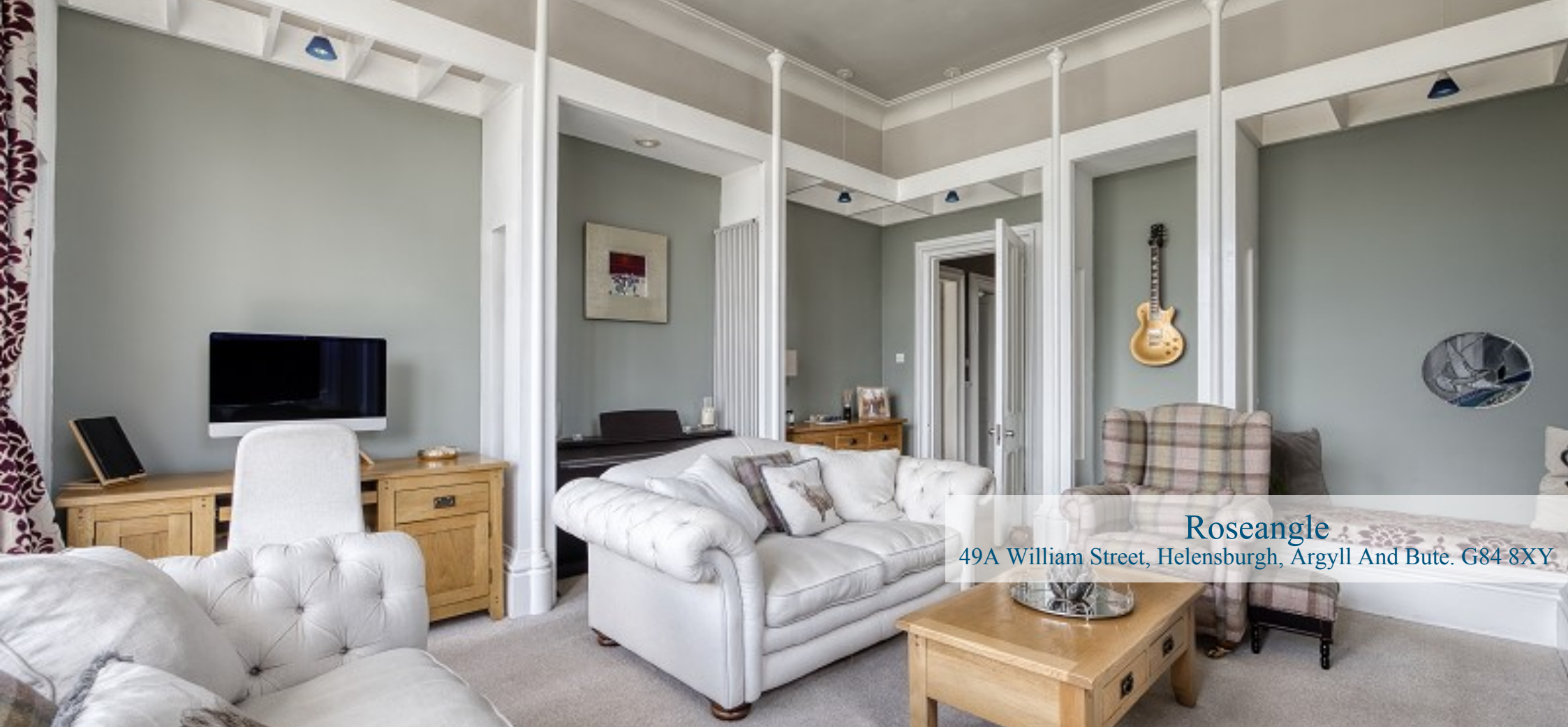
Roseangle 49A William Street, Helensburgh, Argyll And Bute. G84 8XY