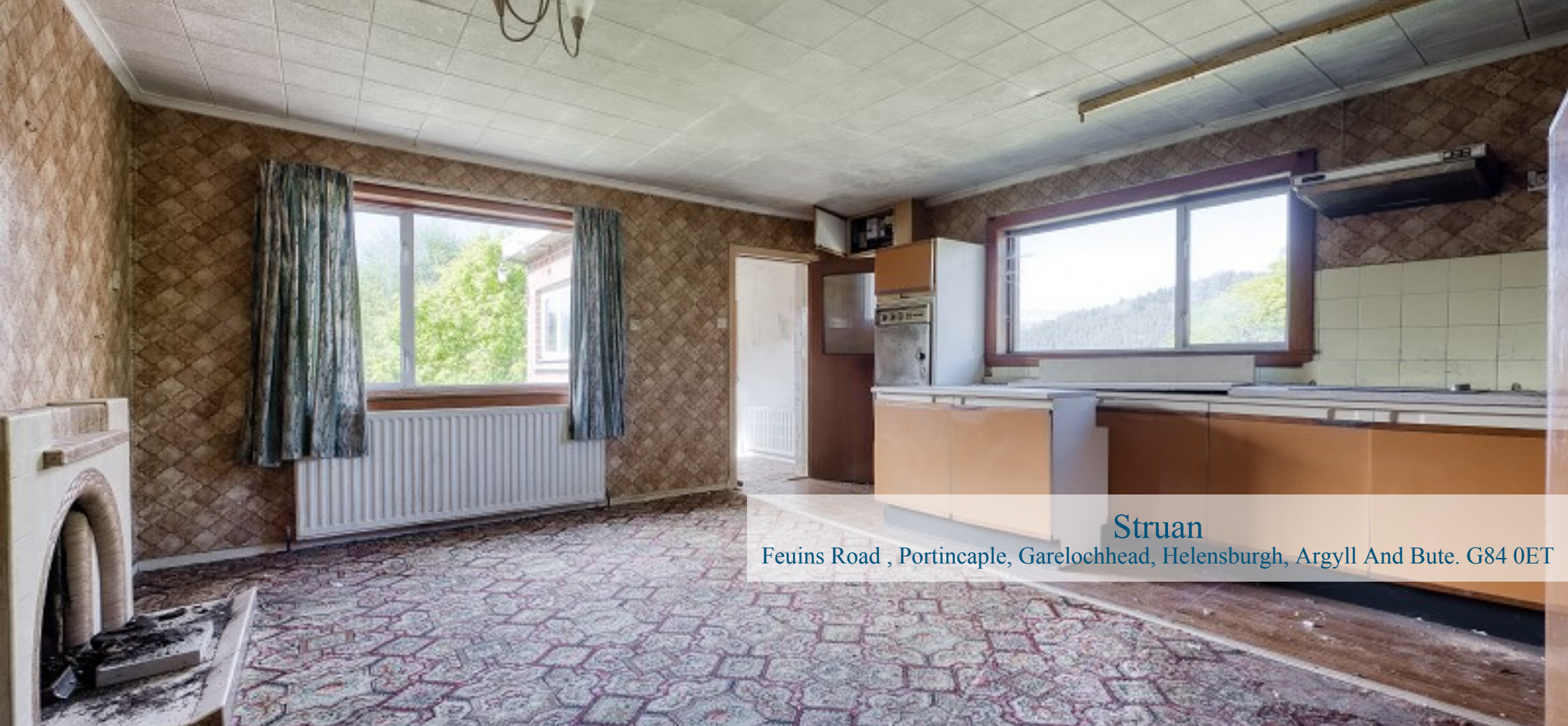
Struan Feuins Road , Portincaple, Garelochhead, Helensburgh, Argyll And Bute. G84 0ET