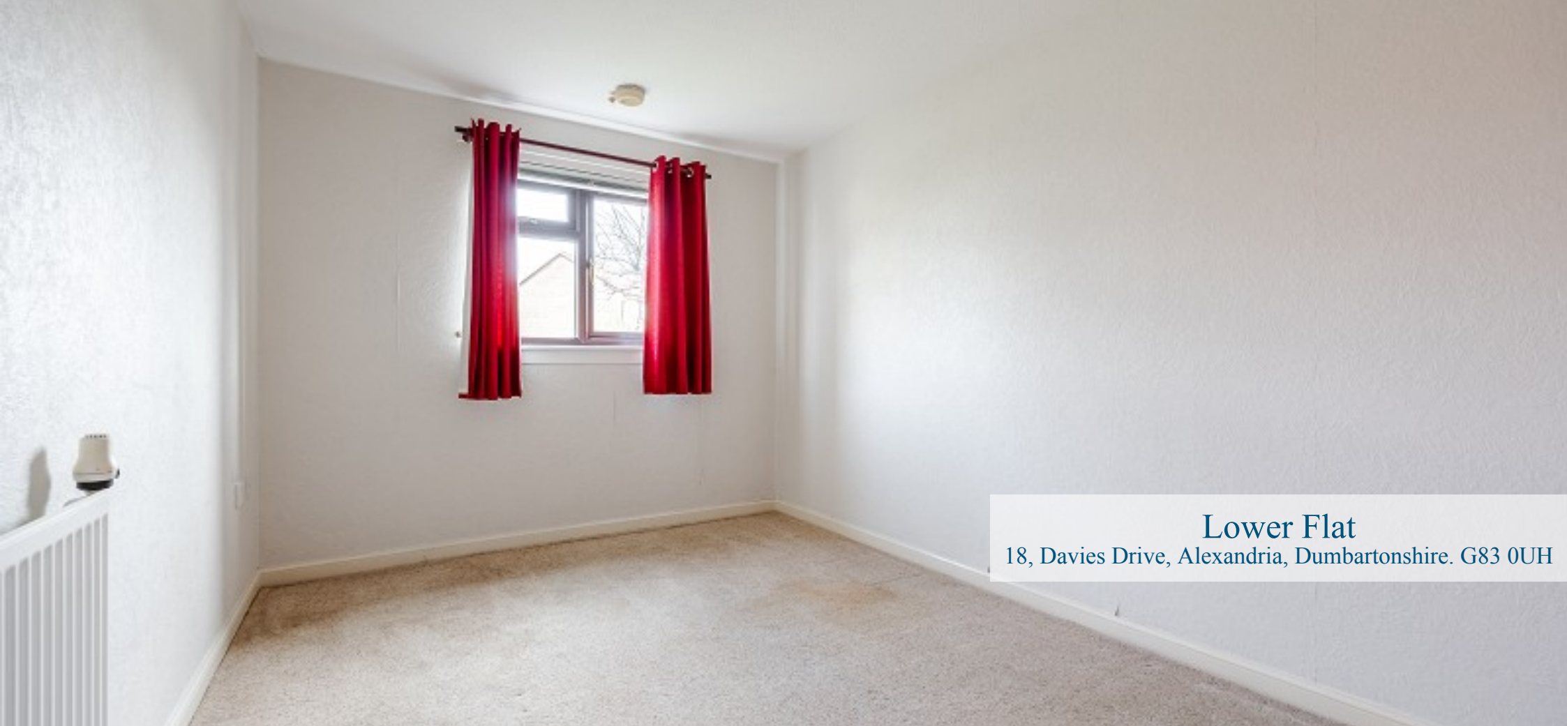
Lower Flat 18, Davies Drive, Alexandria, Dumbartonshire. G83 0UH