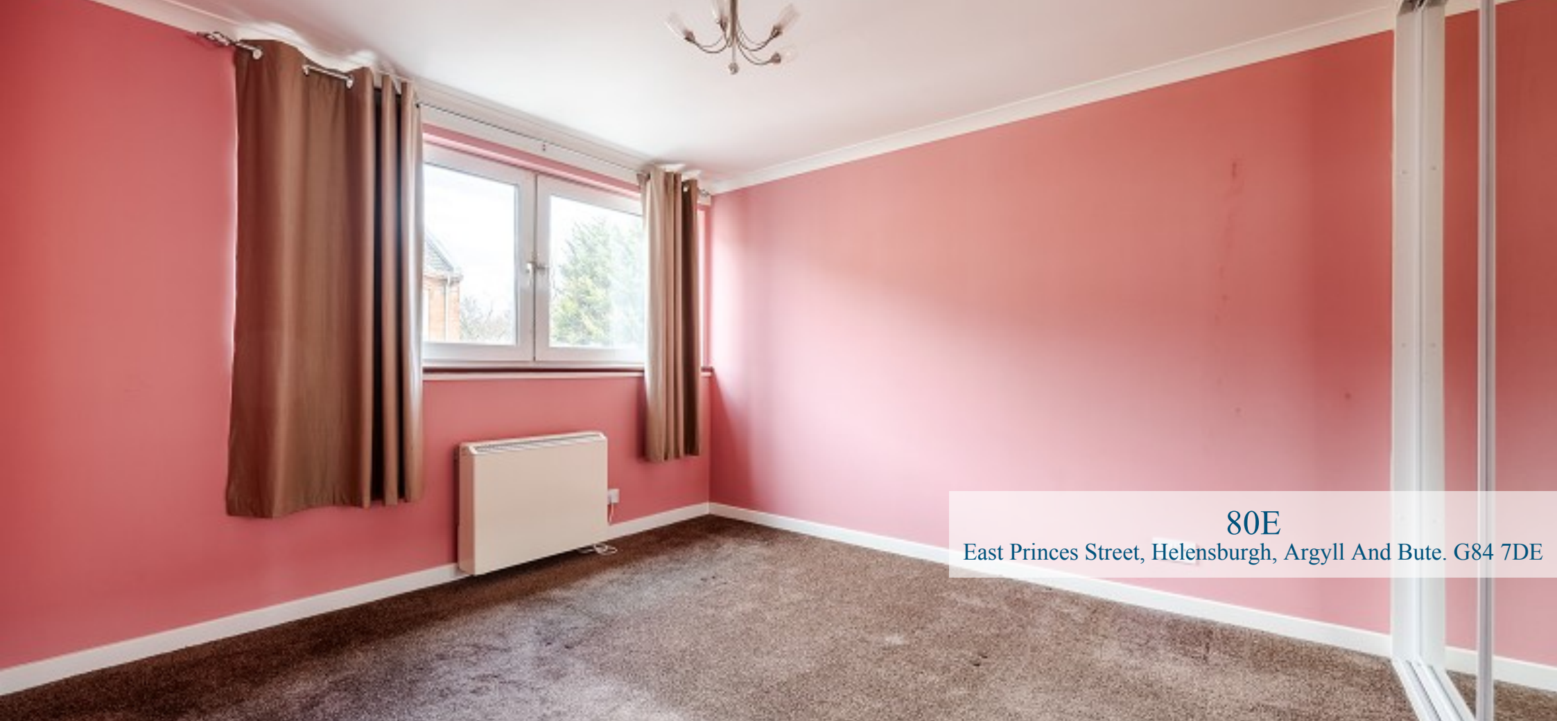
80E East Princes Street, Helensburgh, Argyll And Bute. G84 7DE