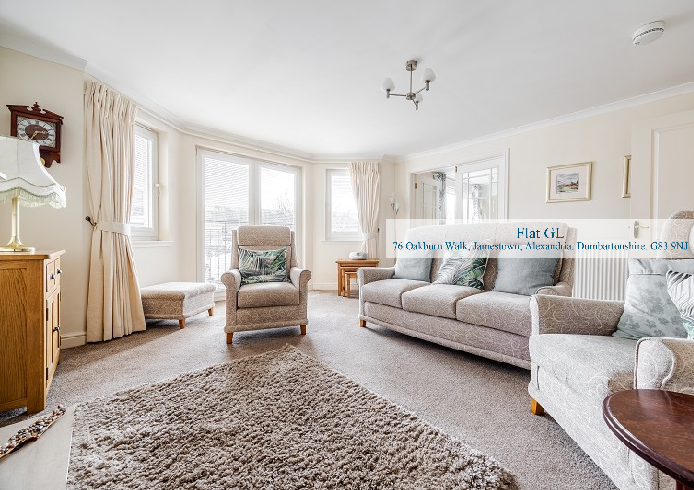
Flat GL 76 Oakburn Walk, Jamestown, Alexandria, Dumbartonshire. G83 9NJ