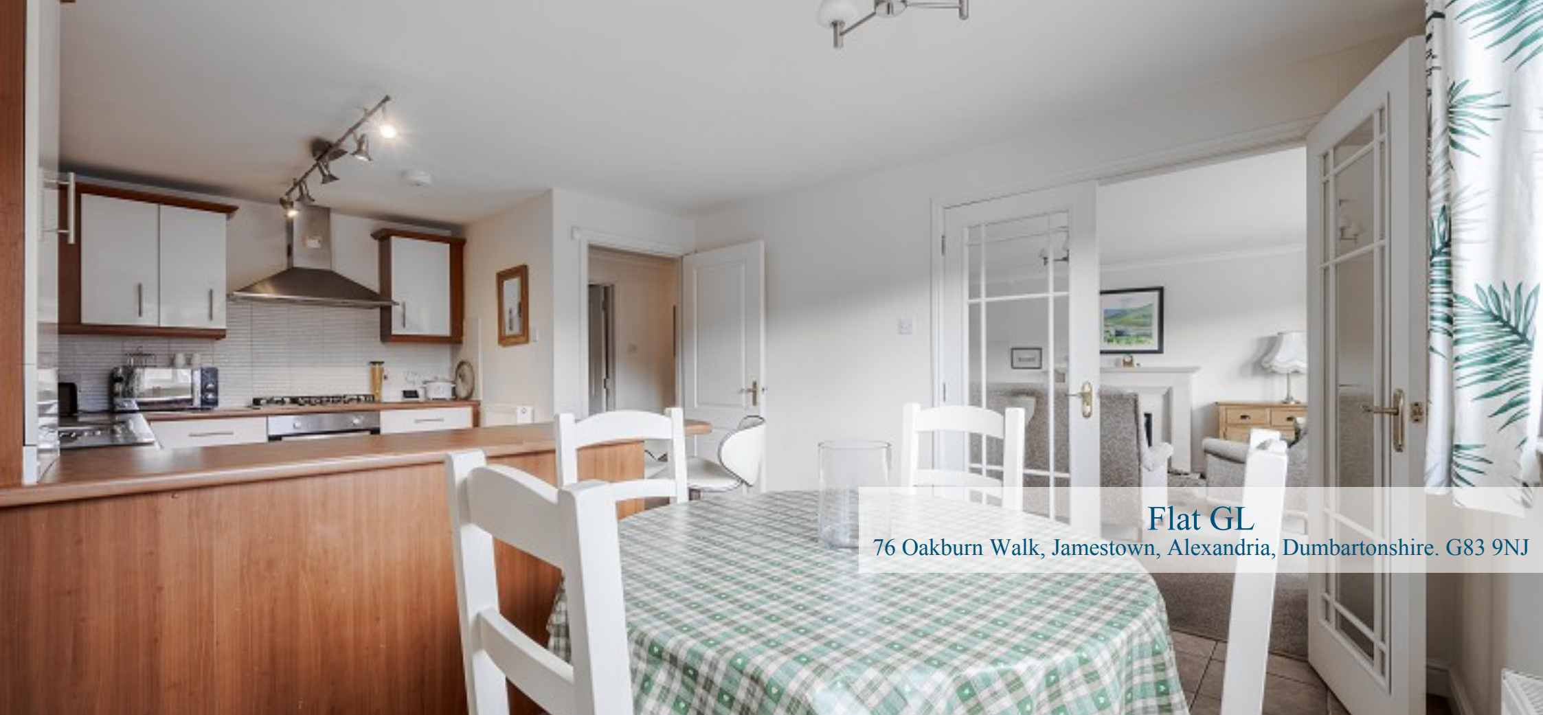
Flat GL 76 Oakburn Walk, Jamestown, Alexandria, Dumbartonshire. G83 9NJ