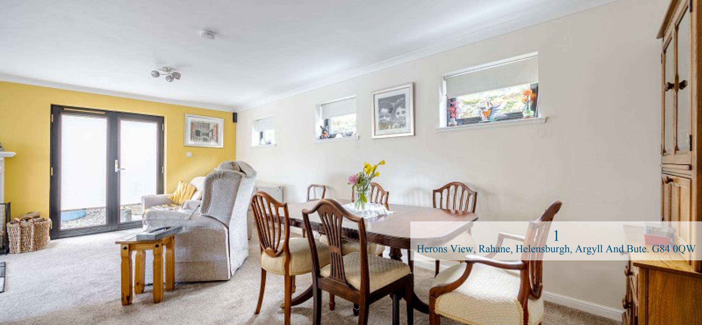
1 Herons View, Rahane, Helensburgh, Argyll And Bute. G84 0QW