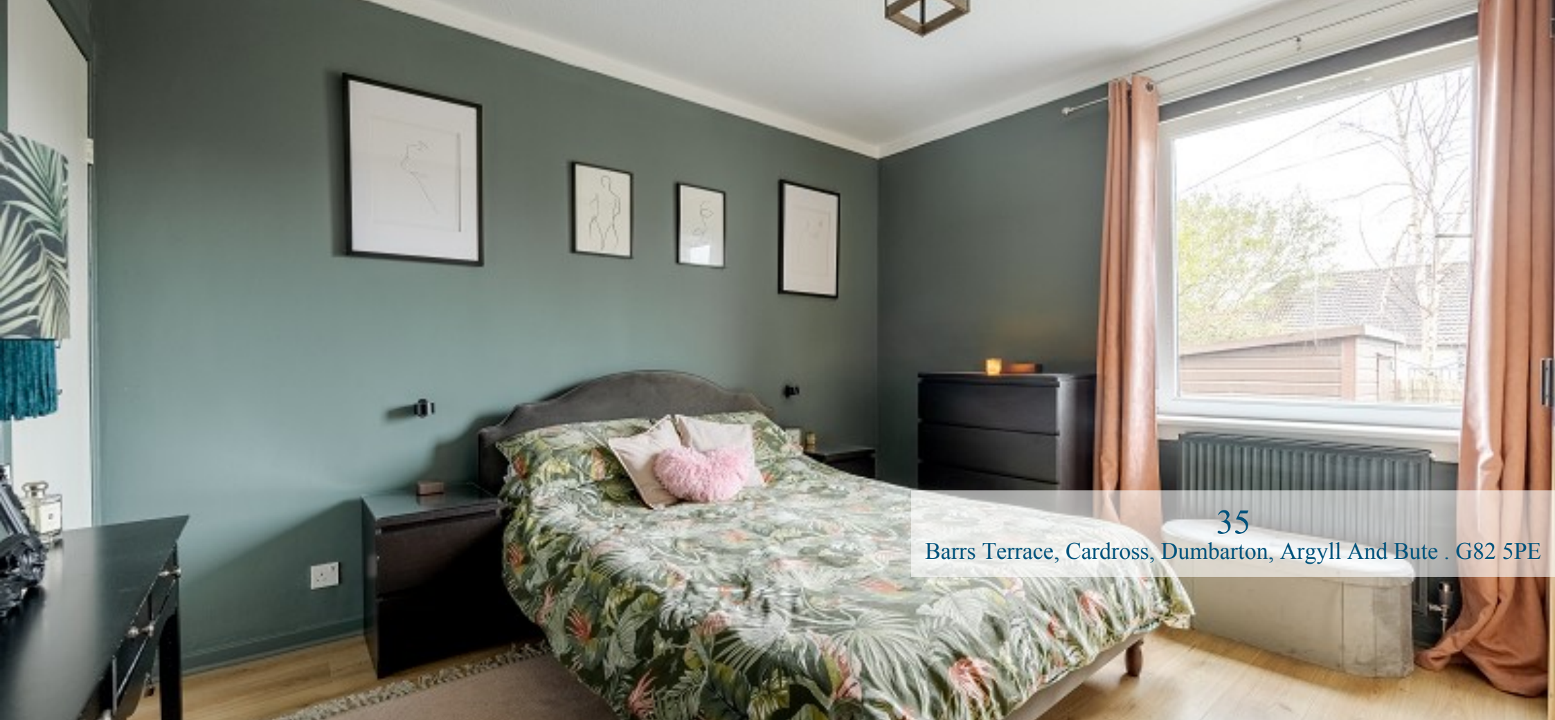
35 Barrs Terrace, Cardross, Dumbarton, Argyll And Bute . G82 5PE