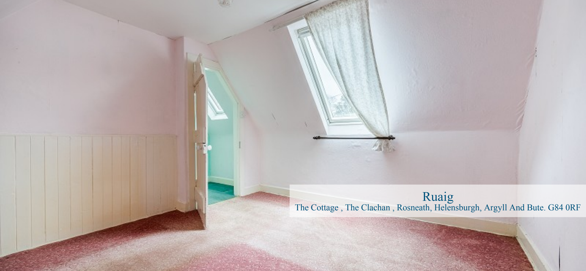
Ruaig The Cottage , The Clachan , Rosneath, Helensburgh, Argyll And Bute. G84 0RF