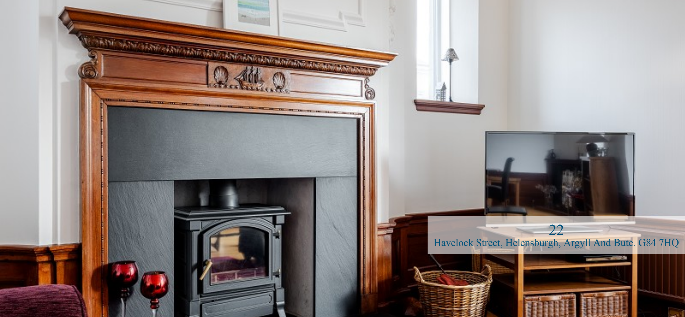
22 Havelock Street, Helensburgh, Argyll And Bute. G84 7HQ