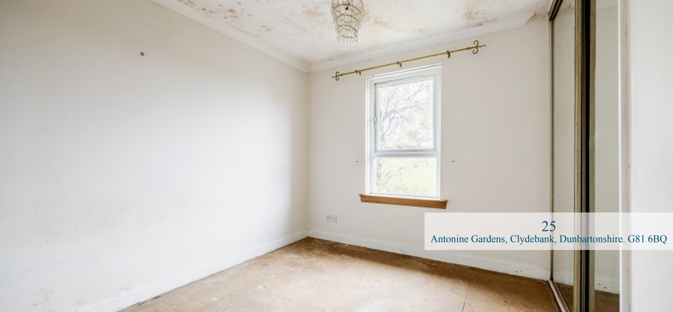
25 Antonine Gardens, Clydebank, Dunbartonshire. G81 6BQ