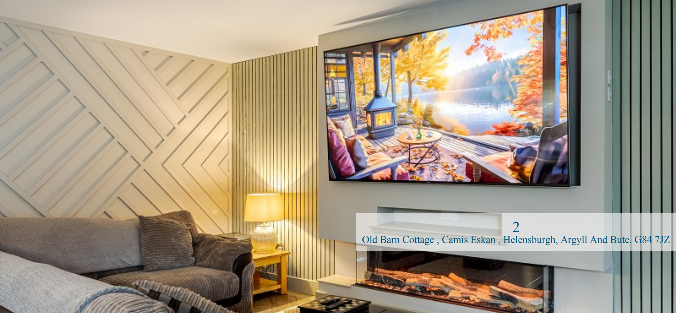
2 Old Barn Cottage , Camis Eskan , Helensburgh, Argyll And Bute. G84 7JZ