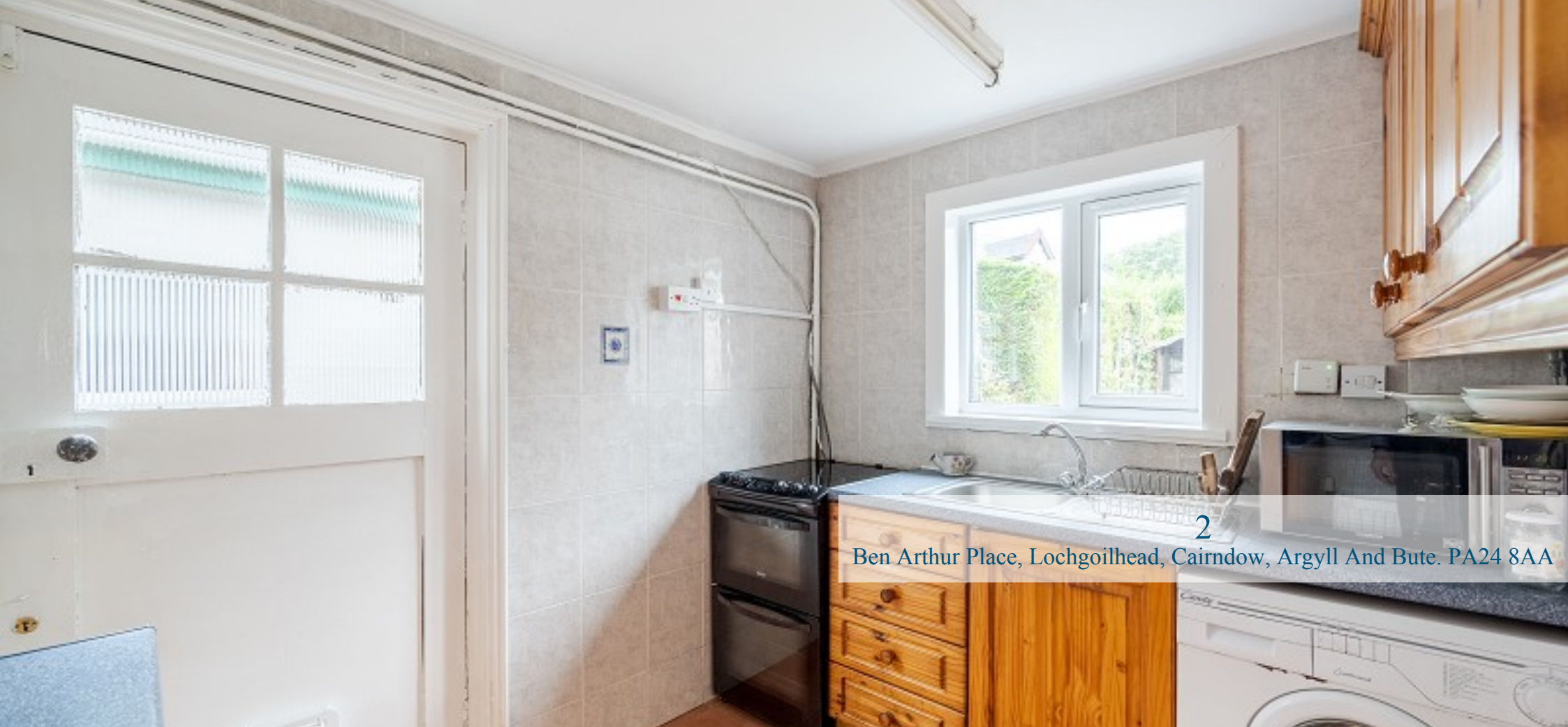
Ben Arthur Place, Lochgoilhead, Cairndow, Argyll And Bute. PA24 8AA