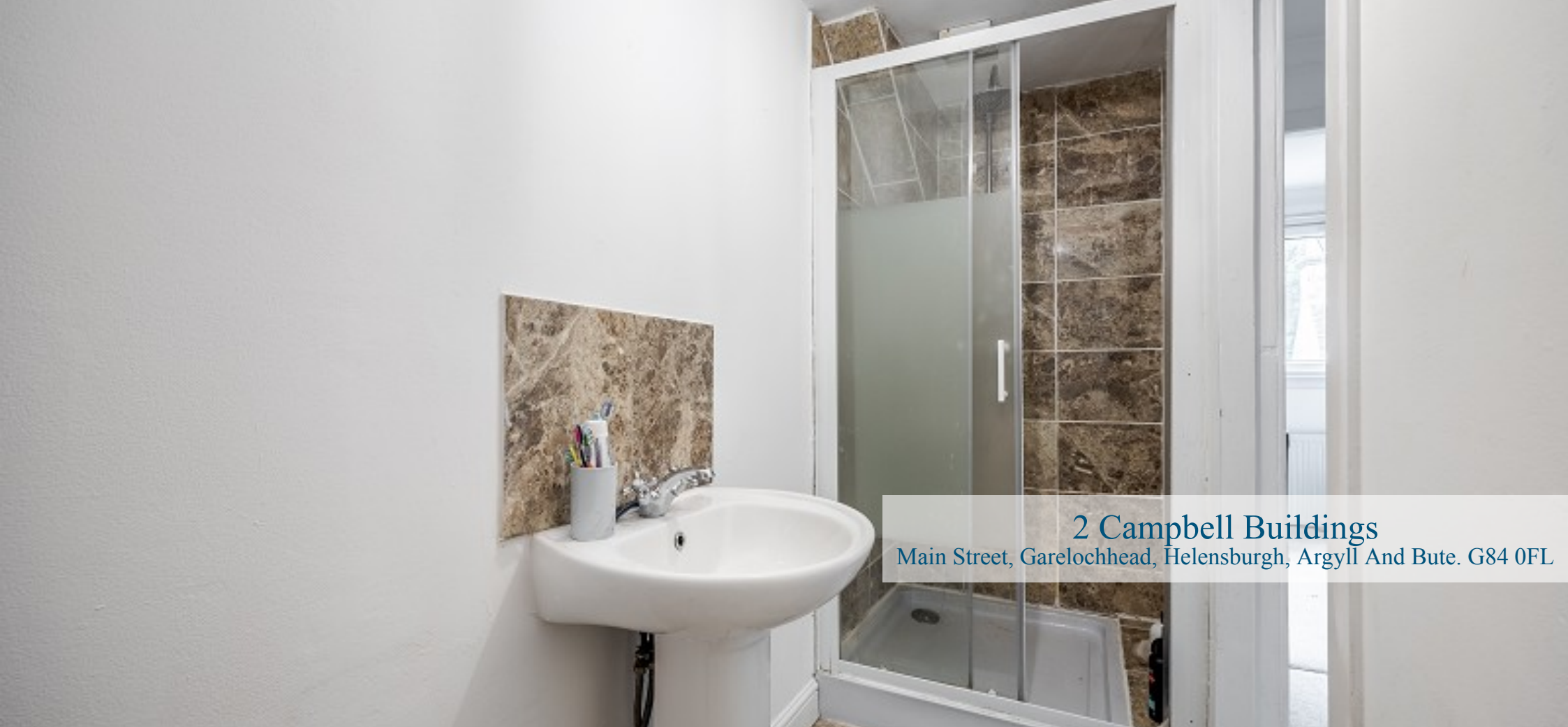
2 Campbell Buildings Main Street, Garelochhead, Helensburgh, Argyll And Bute. G84 0FL