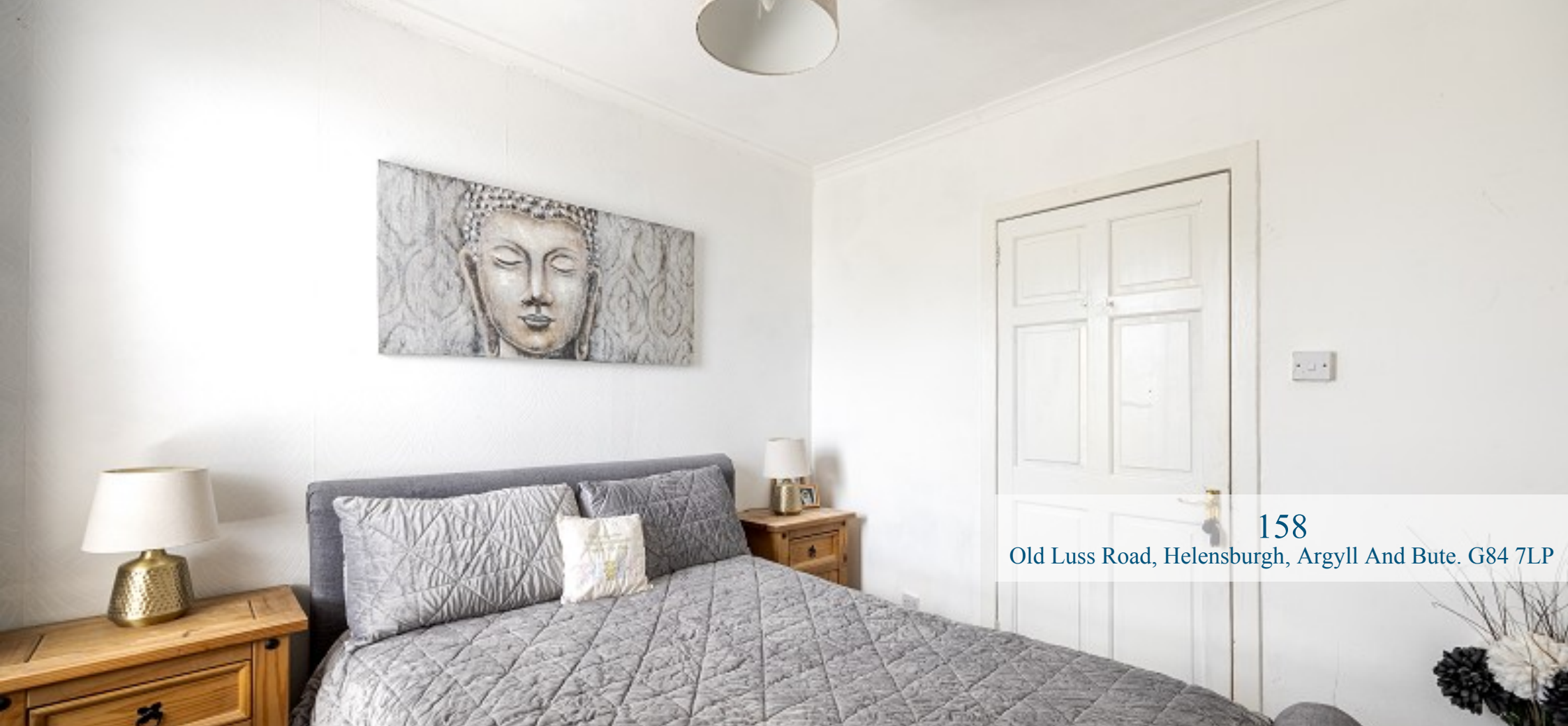
158 Old Luss Road, Helensburgh, Argyll And Bute. G84 7LP