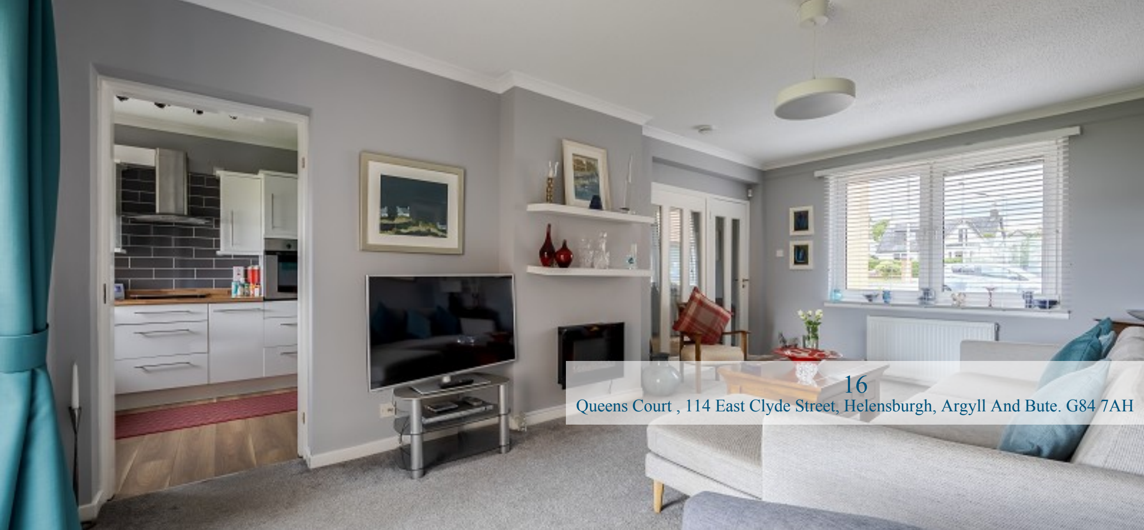
16 Queens Court , 114 East Clyde Street, Helensburgh, Argyll And Bute. G84 7AH