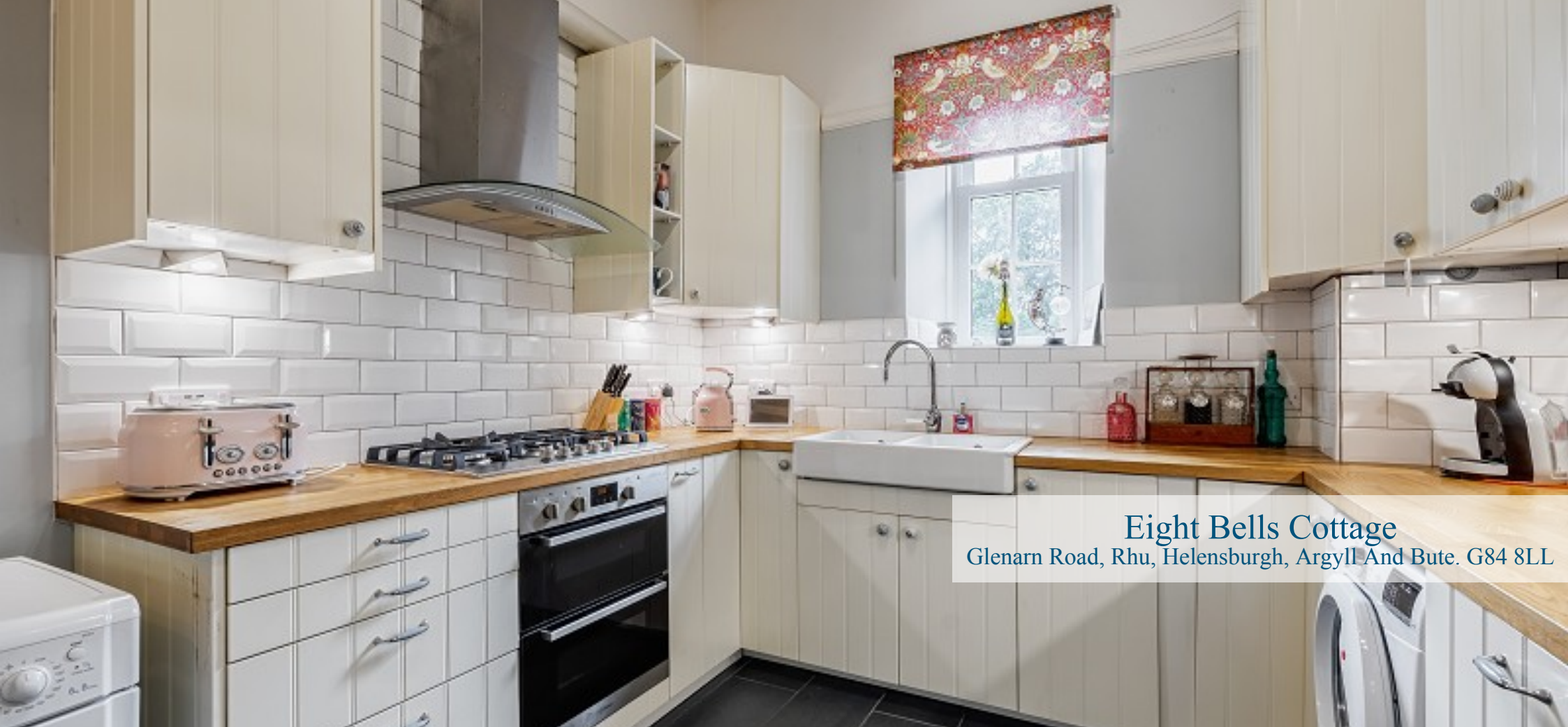
Eight Bells Cottage Glenarn Road, Rhu, Helensburgh, Argyll And Bute. G84 8LL