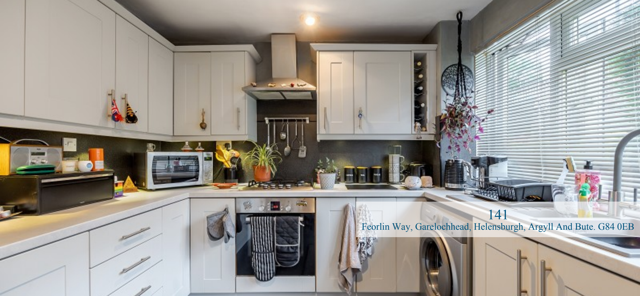
141 Feorlin Way, Garelochhead, Helensburgh, Argyll And Bute. G84 0EB