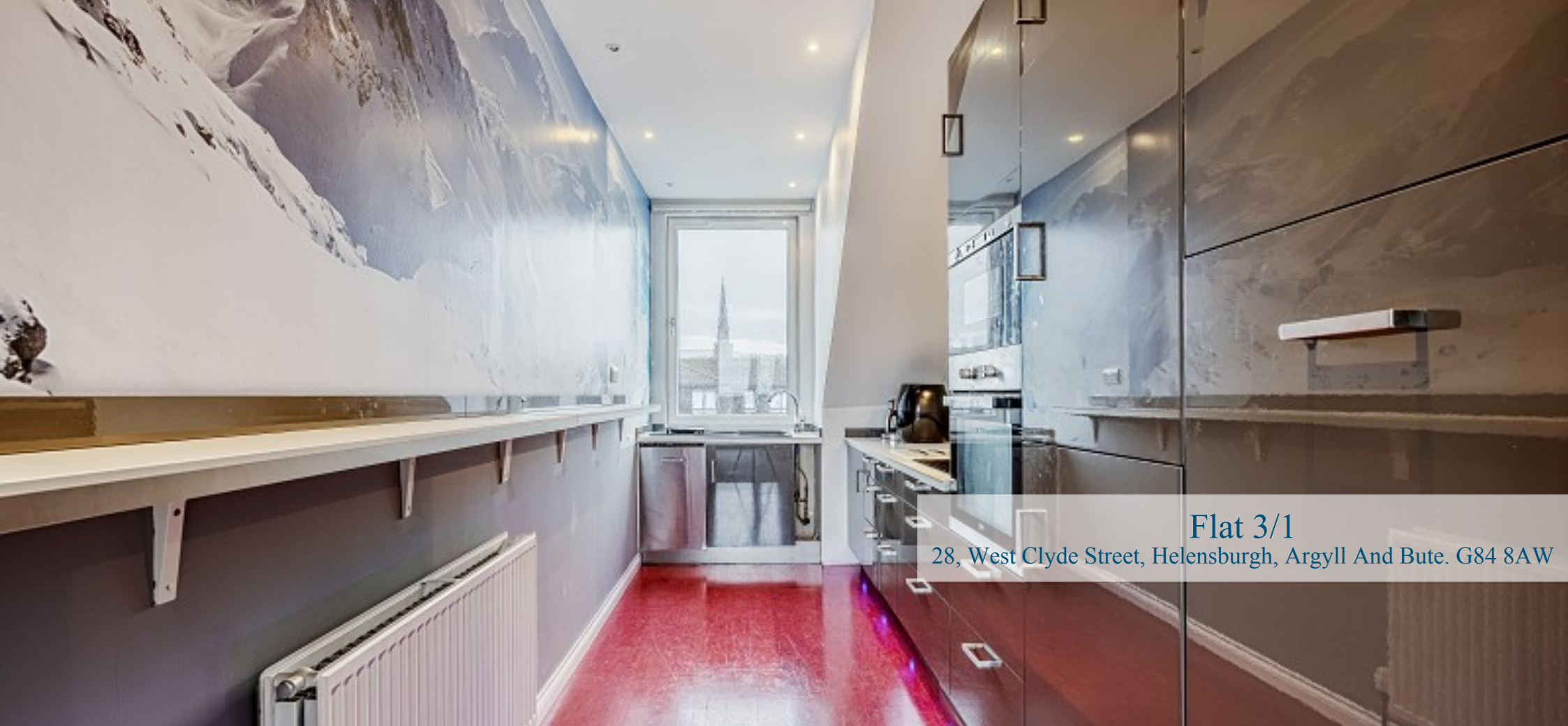
Flat 3/1 28, West Clyde Street, Helensburgh, Argyll And Bute. G84 8AW