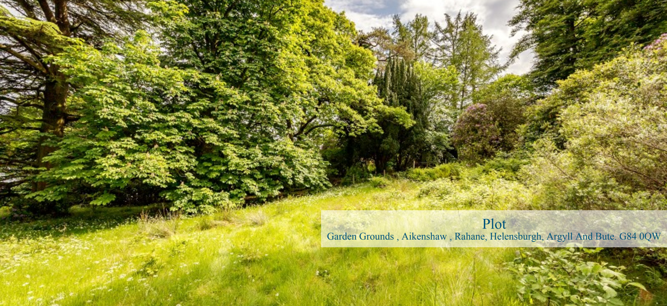
Plot Garden Grounds , Aikenshaw , Rahane, Helensburgh, Argyll And Bute. G84 0QW