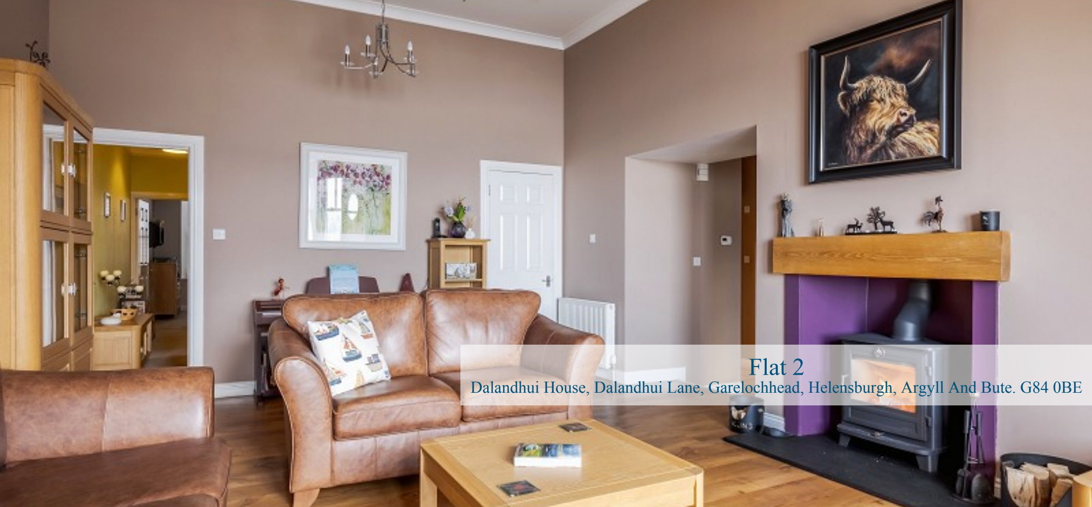
Flat 2 Dalandhui House, Dalandhui Lane, Garelochhead, Helensburgh, Argyll And Bute. G84 0BE