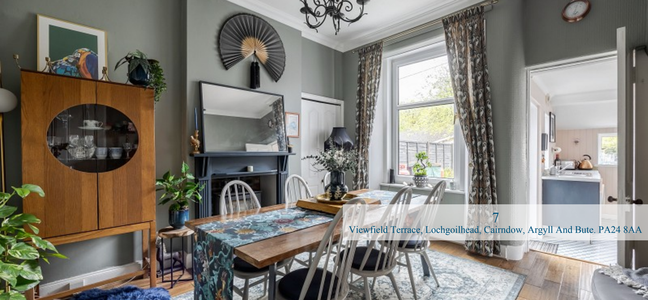
7 Viewfield Terrace, Lochgoilhead, Cairndow, Argyll And Bute. PA24 8AA