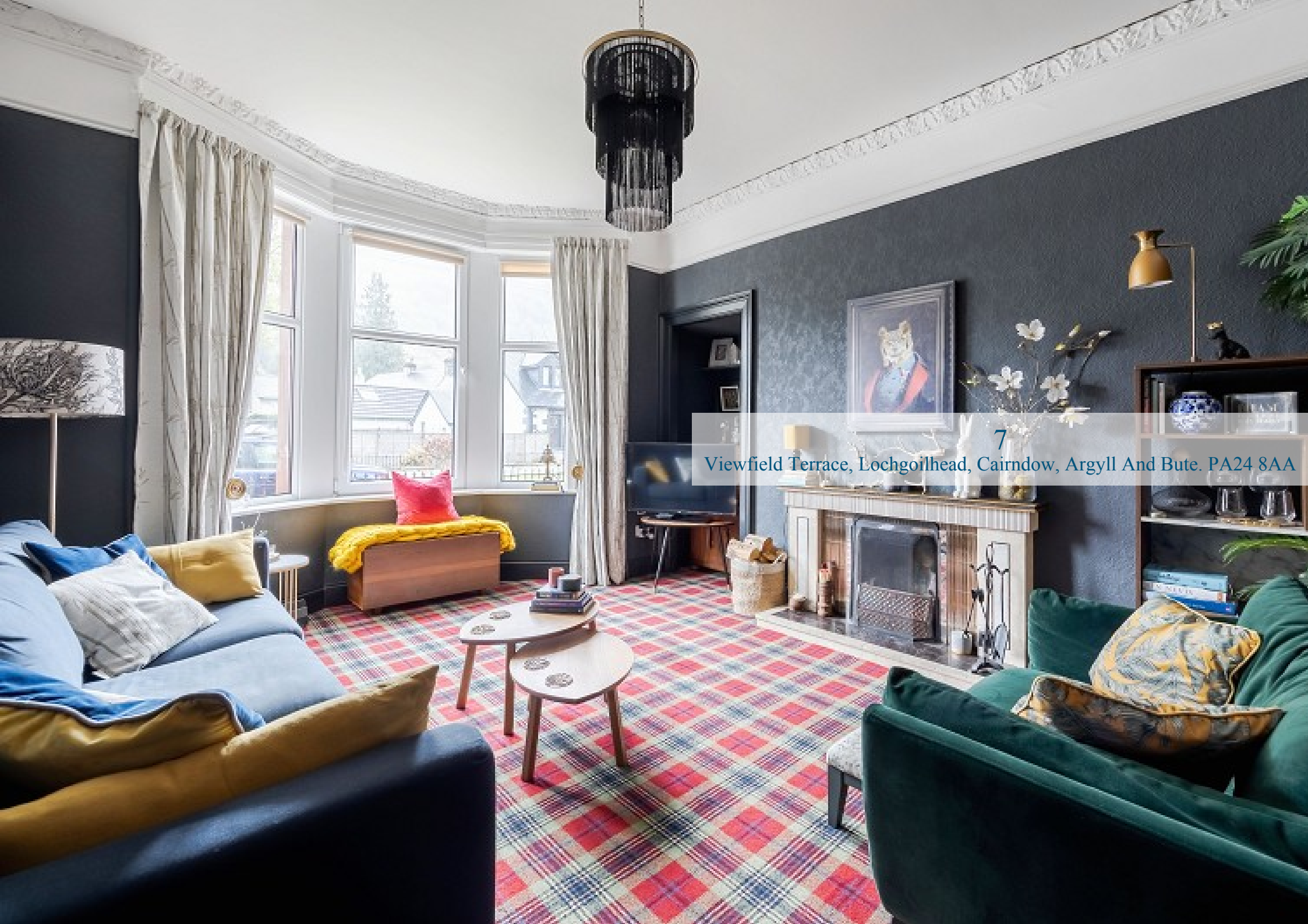
7 Viewfield Terrace, Lochgoilhead, Cairndow, Argyll And Bute. PA24 8AA