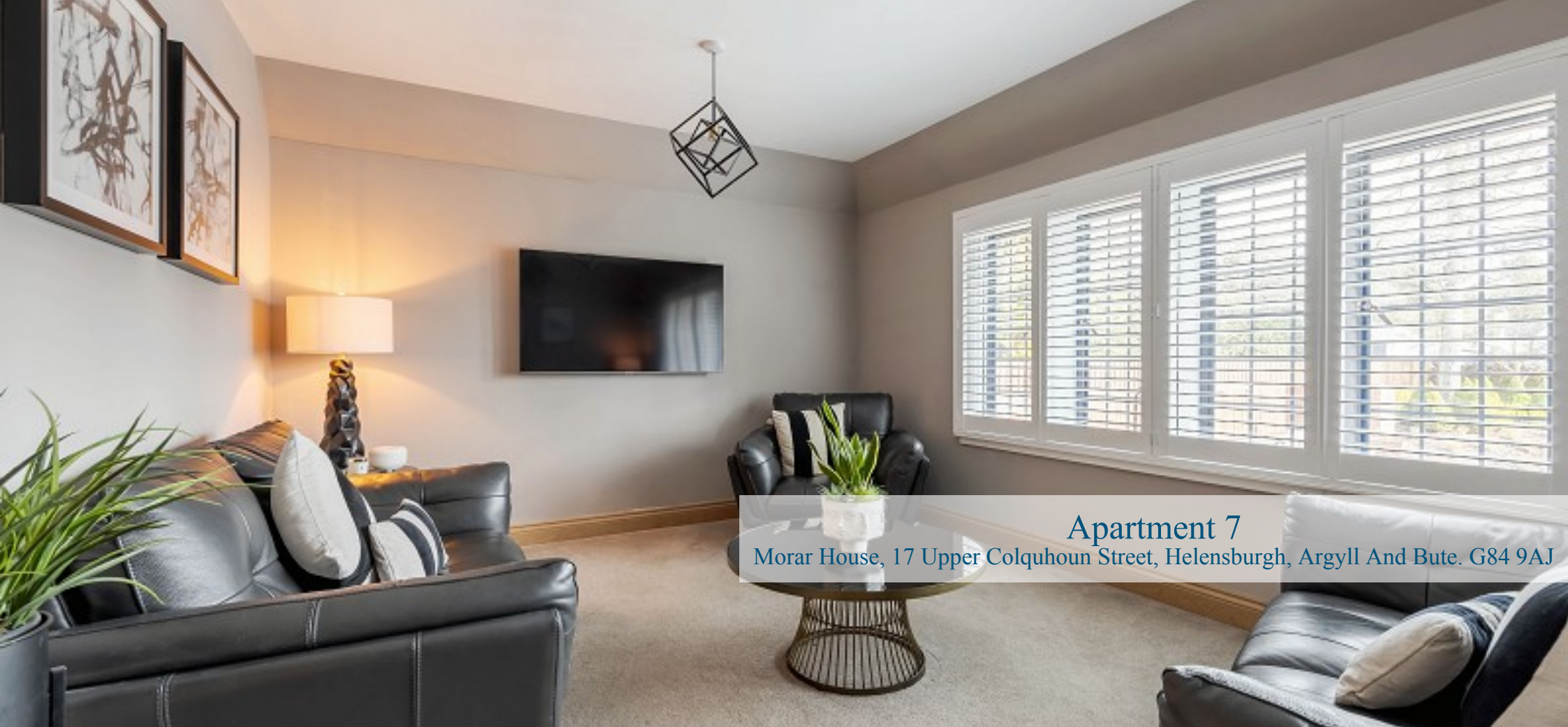
Apartment 7 Morar House, 17 Upper Colquhoun Street, Helensburgh, Argyll And Bute. G84 9AJ