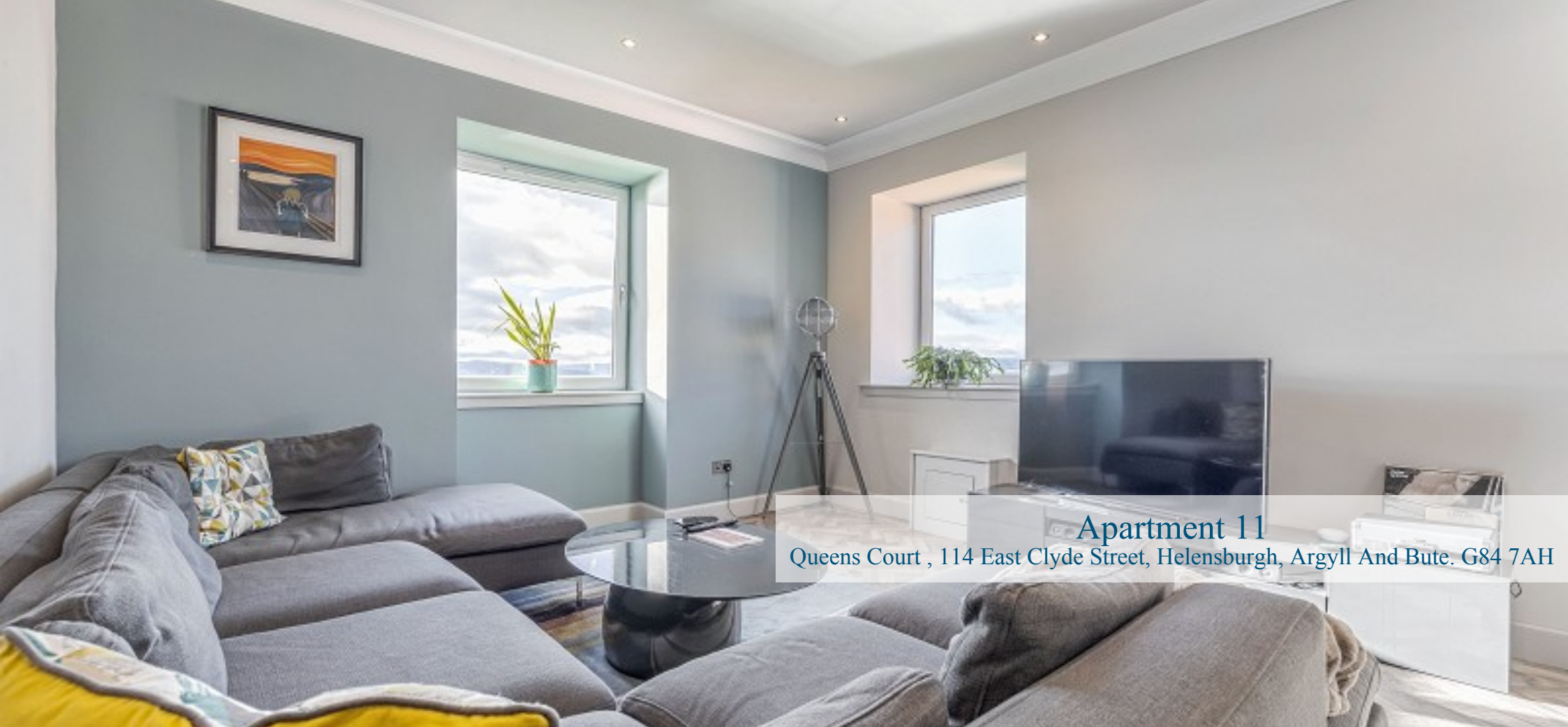
Apartment 11 Queens Court , 114 East Clyde Street, Helensburgh, Argyll And Bute. G84 7AH