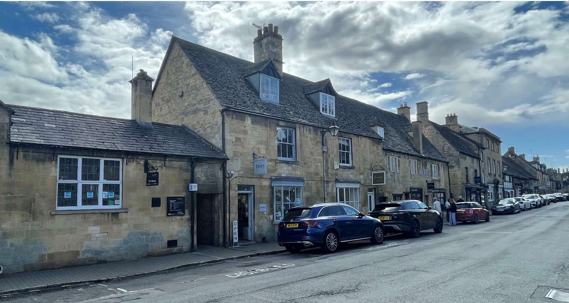
Hook House High Street Chipping Campden, GL55 6AT Guide Price £375,000