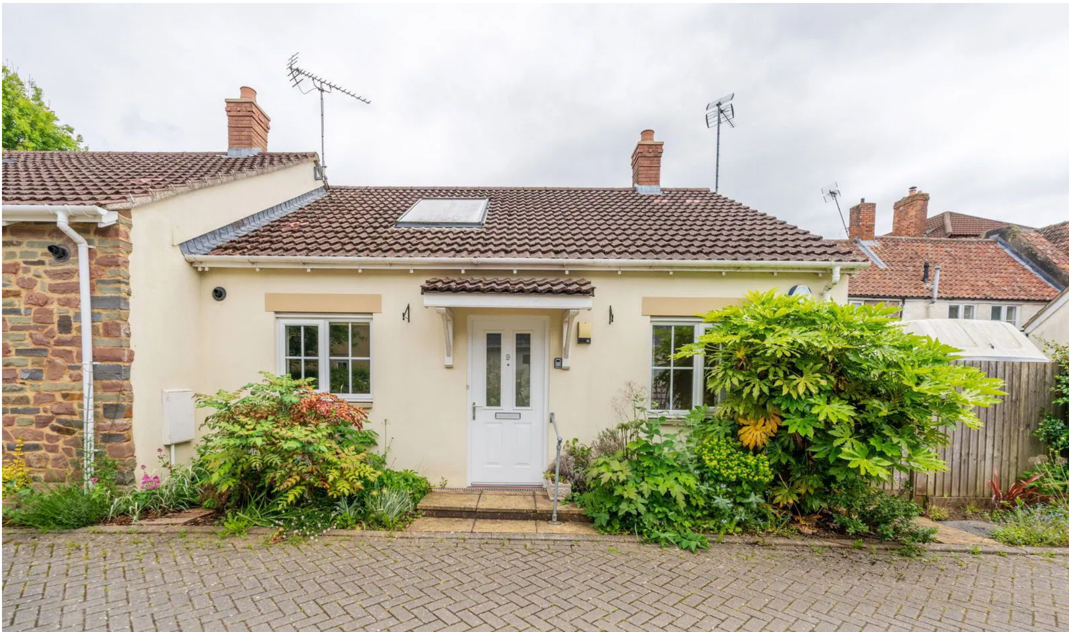
Old Bell Court, Wroughton £299,950