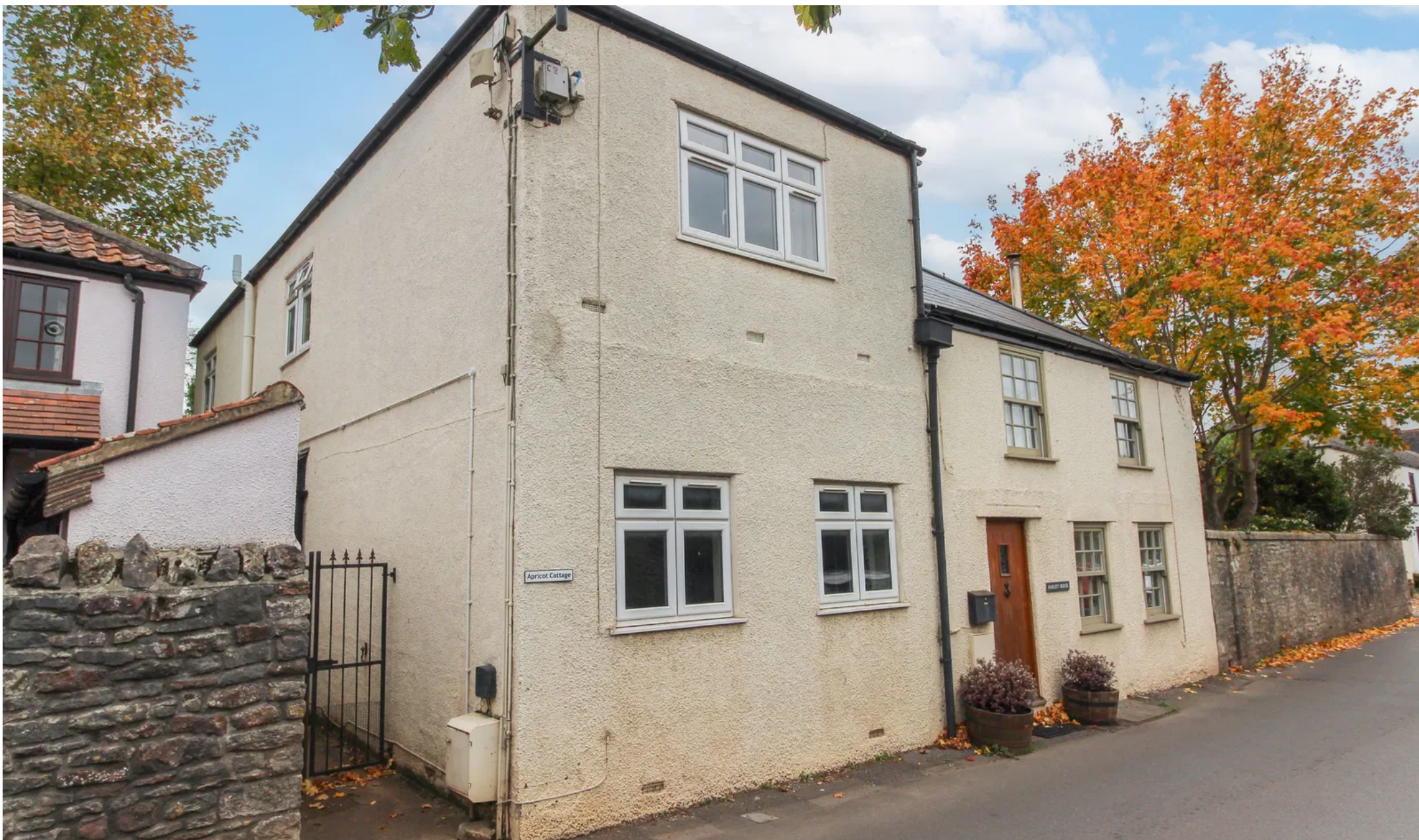
Apricot Cottage, High Street, Wroughton £340,000