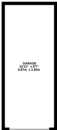
GARAGE 219 sq.ft. (20.4 sq.m.) approx.