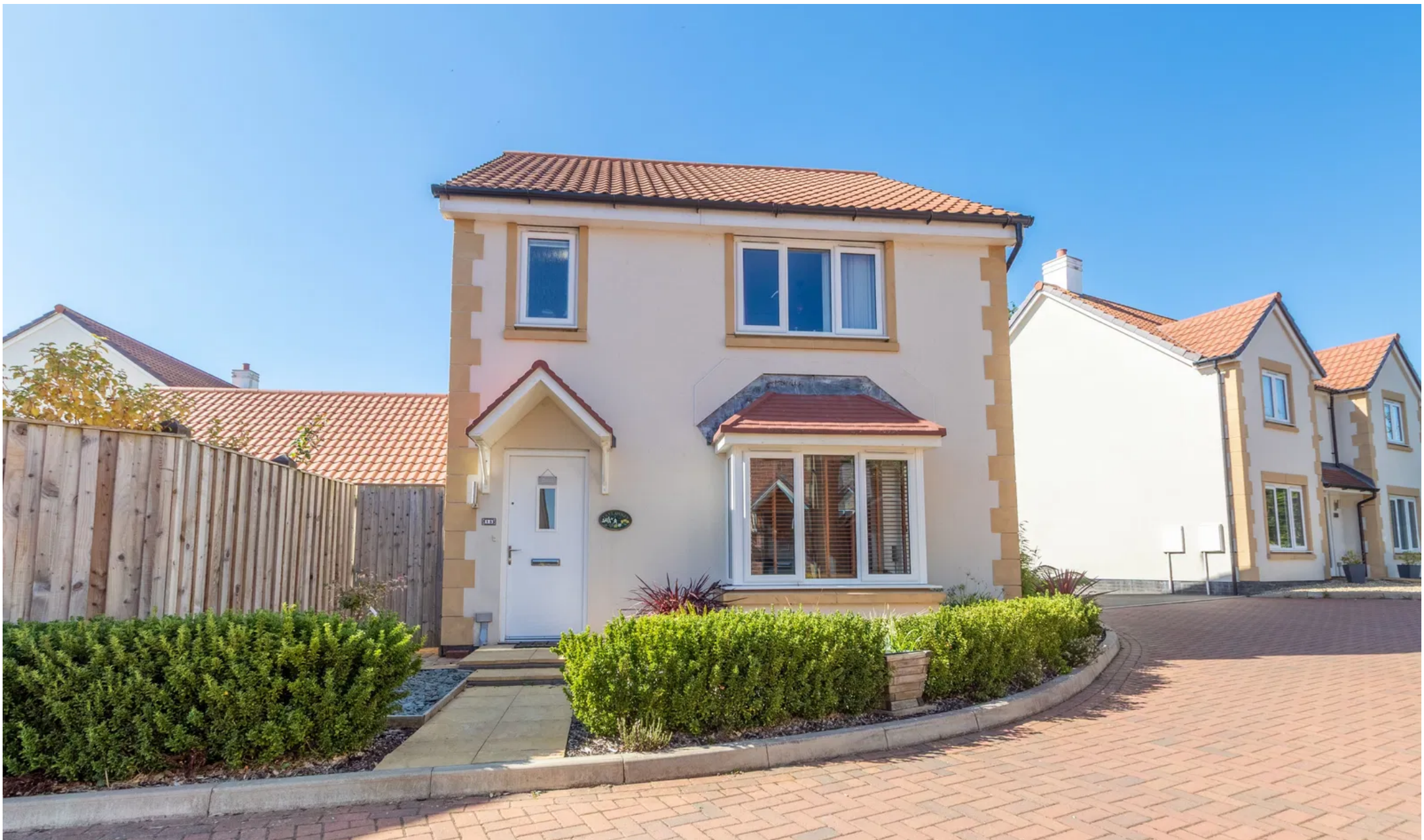
Taylors Fields, Banwell £415,000