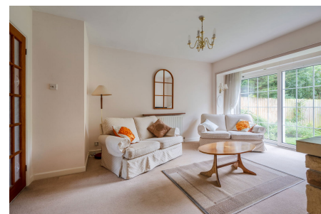
NO ONWARD CHAIN - A three bedroom semi-detached home situated on a popular road with a south facing rear garden, garage and off road parking.