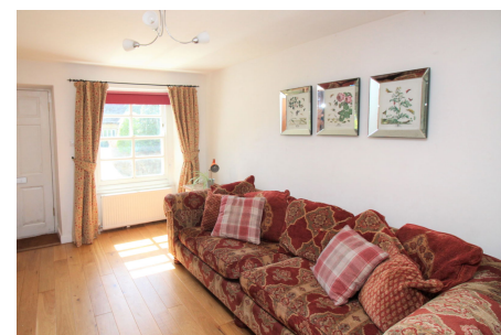
FULL OF CHARM AND DECEPTIVELY SPACIOUS - This classic Chew Magna cottage is the perfect spot to enjoy village life and includes a surprisingly large rear garden. EPC rating D.