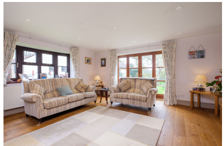
BEAUTIFUL BARN CONVERSION with excellent proportions and four bedrooms, this house enjoys countryside views, a large driveway and garaging